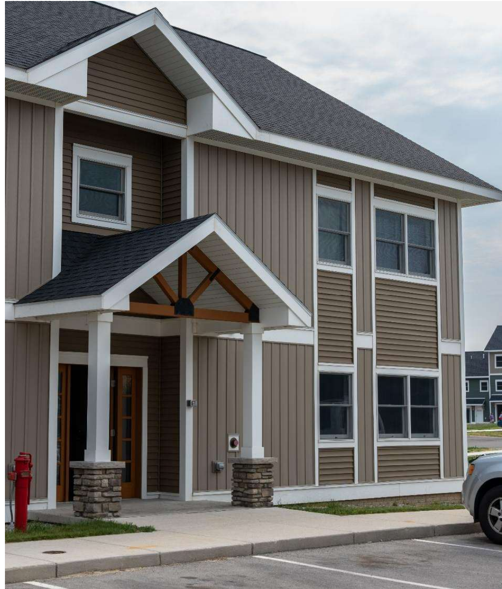
Kchi-Noodin Kaamdaakiing Development, Grand Traverse County.